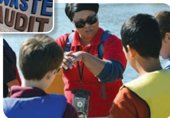
An education volunteer teaches students about the Bay on a SERC field trip.

We're equally fortunate that for decades, we've been able to offer paid internships to students seeking hands-on training. Much of that funding comes from the National Science Foundation, whose Research Experiences for Undergraduates program specifically reaches out to minorities and students from schools with limited research opportunities. And some of our internships focus on education and journalism as well as research, allowing us to show how science can impact society in other fields as well.