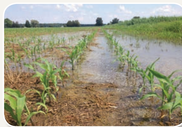
Corn fields in America's coastal south are continuously hurt by saltwater flooding. Crops like corn and wheat can't tolerate high levels of salt in the water.

American agriculture is especially vulnerable to saltwater intrusion from water irrigation and storm surges, to the point where farmers consider abandoning old fields where it's impossible to grow healthy crops. Classic crops like corn and wheat have little salt tolerance and die in places where the salinity is too high. Meanwhile, invasive species that thrive in saltier soil can take over areas once used for