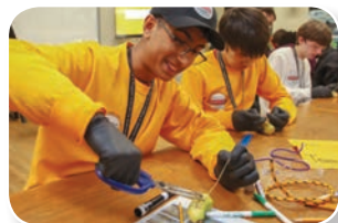
Visiting middle school students practice inserting tags into a "banana shark" in SERC's newest engineering and design STEM program.

Our citizen science team is also finding more ways to mobilize nature enthusiasts. Their Invader ID project, which began last year as a simple website to identify creatures on underwater SERC tiles, is now allowing residents in the Chesapeake to hang tiles from their own docks and watch life grow on them.