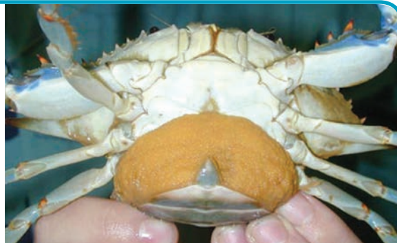
Female blue crabs can make several "egg sponges" like this throughout their lives to reproduce, but they mate only once.

When a fishery is in danger, the first line of defense is often protecting reproductive females—because generally, more mothers means more babies. But a literature review published in Invertebrate Reproduction & Development by SERC scientist Matt Ogburn suggests that for crustaceans, it might be a little more complicated.